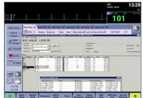
Access and modify external data with CARESCAPE iPanel

© 2009 General Electric Company – All rights reserved General Electric Company reserves the right to make changes in specifications and features shown herein, or discontinue the product described at any time without notice or obligation. Contact your GE Representative for the most current information.