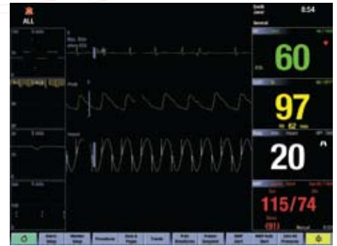
Assess patient status with adjustable Minitrends and live waveforms in one screen